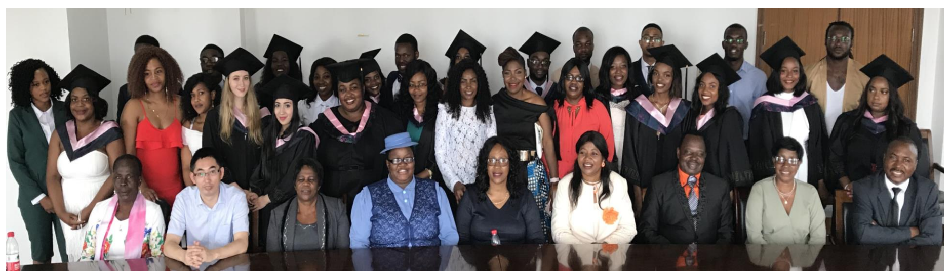
14Q Family Photo